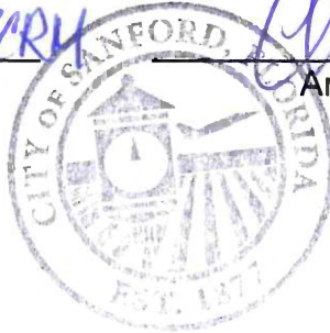
Art Woodruff, Mayor

For use and reliance of the Sanford City Commission only. Approved as to form and legality.