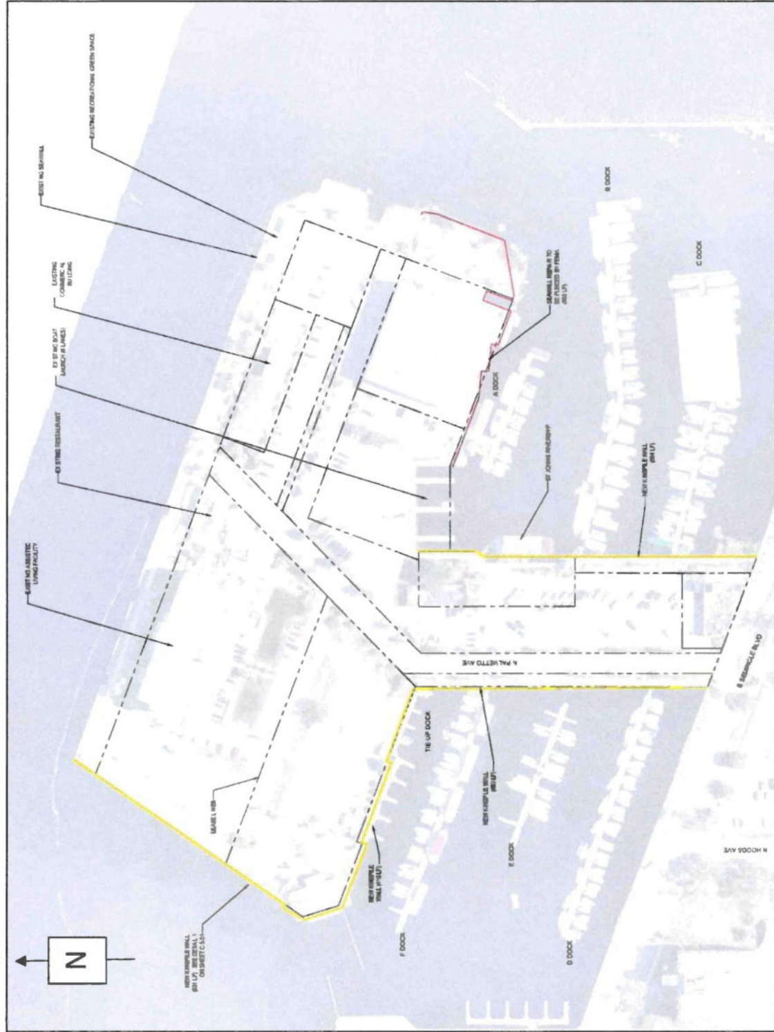
Figure 3. Aerial Map showing locations of planned seawall improvements (yellow highlighted areas)