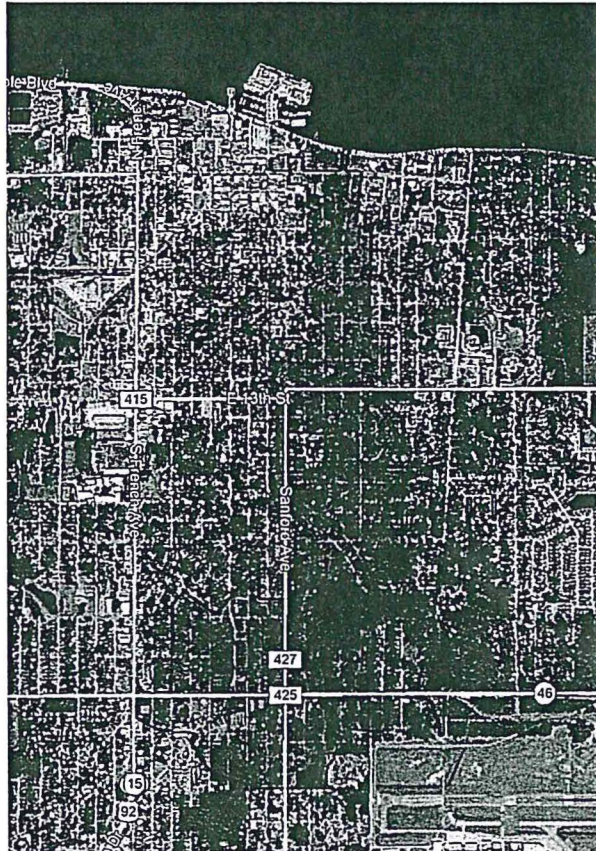
Figure 1: Pump Branch Basin Boundary

The proposed scope of services for the first phase of work is presented below. The estimated fees are included in Attachment 1 .